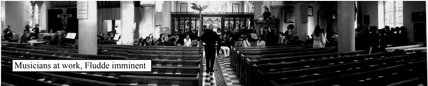
Musicians at work, Fludde imminent

I can assure all readers it was not the case that anyone at St. Mary's had a premonition about the awful summer we've all just endured when the "Pro Musica" Committee decided early last Spring to put on a performance of Benjamin Britten's "Noye's Fludde" in the Autumn! We all thought it would be an excellent way of raising the profile of our Music Department in the local community and, perhaps, show that members of the Parish Choir have even more talent than can be seen on a normal Sunday.